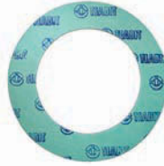
GASKETS FIGURE NA/R/NE