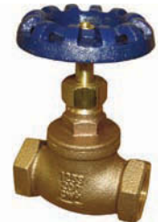
BRONZE GLOBE VALVE FIGURE 1231/1232