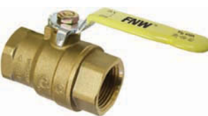
BRASS BALL VALVE FIGURE 410A