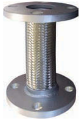
FLEXIBLE CONNECTORS FIGURE 30F/30T/35S/40A