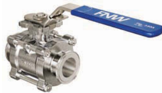
SS BALL VALVE FIGURE 330A