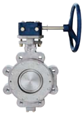
BUTTERFLY VALVE FIGURE HPA