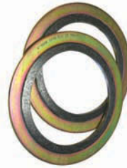
GASKETS FIGURE SWG