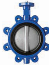
BUTTERFLY VALVE FIGURE 832