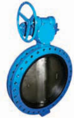
BUTTERFLY VALVE FIGURE 752