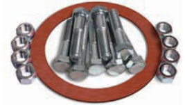
NUT/BOLT/GASKET KITS FIGURE NBG