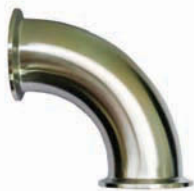
3-A FITTINGS 304 & 316 SANITARY STAINLESS