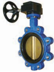
BUTTERFLY VALVE FIGURE 812