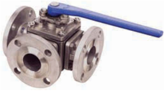
SS BALL VALVE FIGURE 633/634