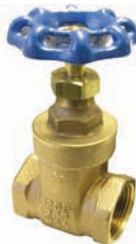
BRONZE GATE VALVE FIGURE 1211/1212