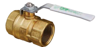
BRASS BALL VALVE FIGURE 415LL