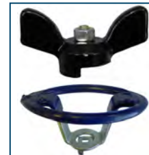
Tee or Oval Handle